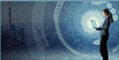
Autonomous Wave Control (AWC)